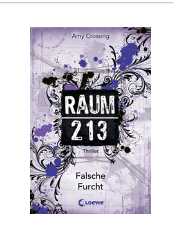
Room 213 – False Fear