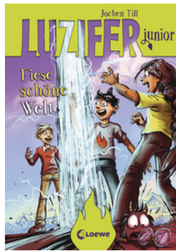
Lucifer Junior - Nasty New World (Vol.7)