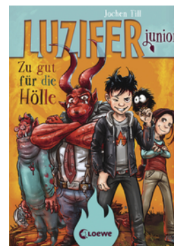
Lucifer Junior – Too Good For Hell (Vol. 1)