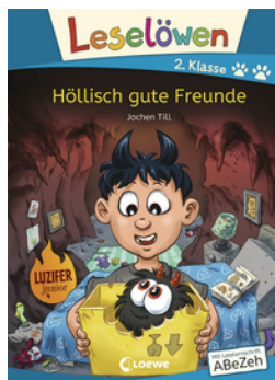
Reading Lions Year 2 - Hellish Good Friends (Lucifer jr. Prequel)