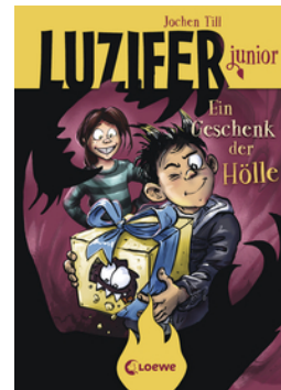
Lucifer Junior - A Gift from Hell (Vol. 8)