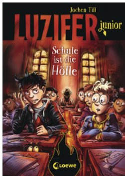
Lucifer Junior - School is Hell (Vol. 6)