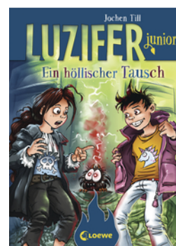
Lucifer Junior - A Hell of a Change (Vol. 5)