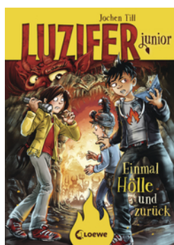
Lucifer Junior - To Hell and Back (Vol. 3)