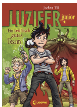
Lucifer Junior – A Devilishly Good Team (Vol. 2)