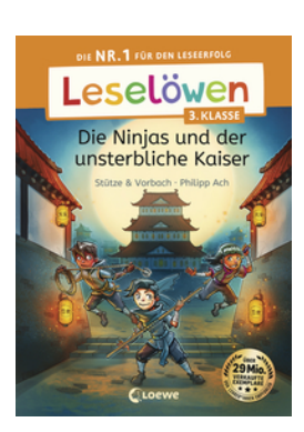
Reading Lions (Year 3) - The Ninjas and the Immortal Emperor