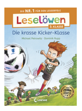
Reading Lions (Year 3) The Toughest Kicker-Class