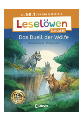
Reading Lions (Year 3) The Duell of the Wolfs