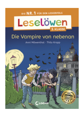
Reading Lions (Year 3) - The Vampires Next Door