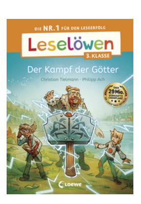
Reading Lions (Year 3) – The Battle of Gods