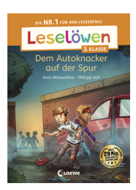
Reading Lions (Year 3) - On the Trail of the Car Burglar