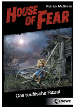
House of Fear – The Devilish Rite (Vol. 6)