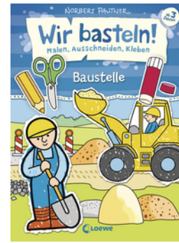
Let's Do Arts and Crafts! - Construction Site