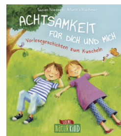
Attentiveness for All of Us! – Story Time is Cuddle Time!