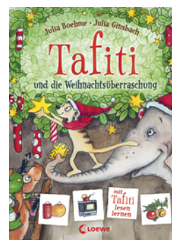
Tafiti - The Christmas Surprise