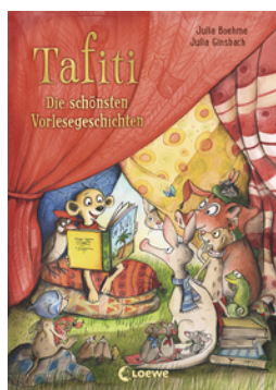
Tafiti – The Best Story Time Adventures for Reading Together