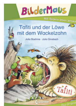
PictureMouse - Tafiti and the Lion with the Wobbly Tooth