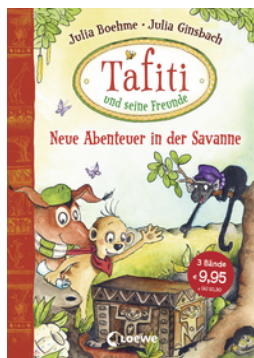
Tafiti and His Friends - New Adventures in the Savannah (Vol. 4-6)