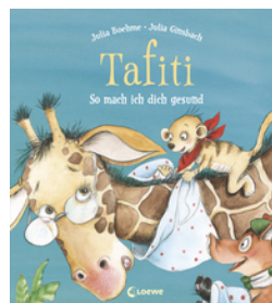
Tafiti – That's How You Get Well