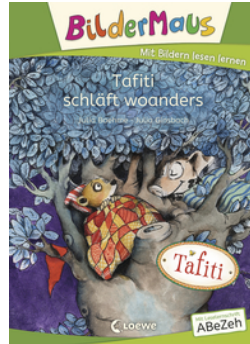
Picture Mouse - Tafiti Sleeps Somewhere Else