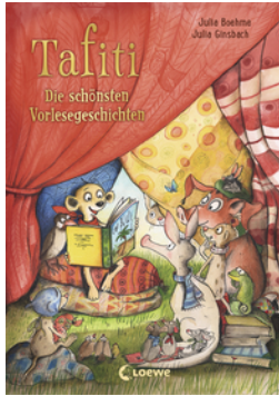
Tafiti – The Best Story Time Adventures for Reading Together