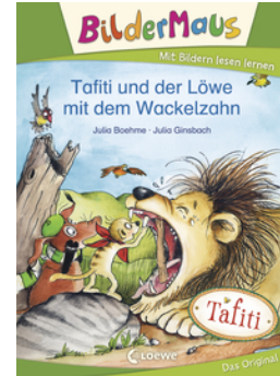
PictureMouse - Tafiti and the Lion with the Wobbly Tooth