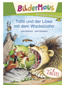
PictureMouse - Tafiti and the Lion with the Wobbly Tooth