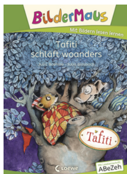
Picture Mouse - Tafiti Sleeps Somewhere Else