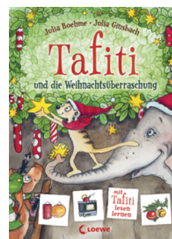
Tafiti - The Christmas Surprise