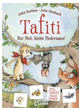
Tafiti – Be Brave, Little Bat!