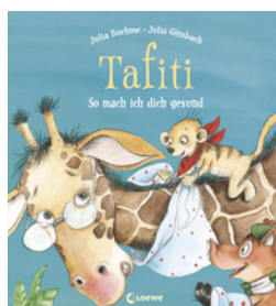
Tafiti – That's How You Get Well