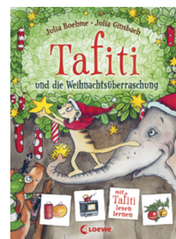
Tafiti - The Christmas Surprise