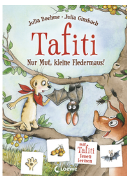
Tafiti – Be Brave, Little Bat!