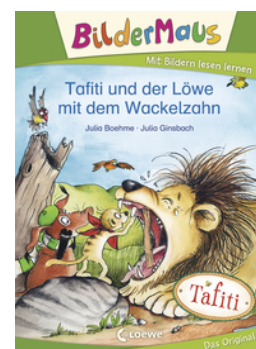
PictureMouse - Tafiti and the Lion with the Wobbly Tooth