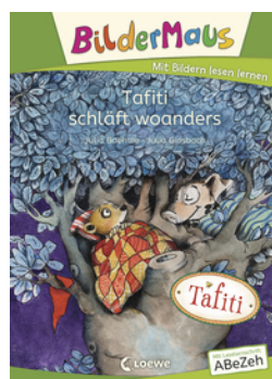
Picture Mouse - Tafiti Sleeps Somewhere Else