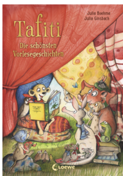
Tafiti – The Best Story Time Adventures for Reading Together