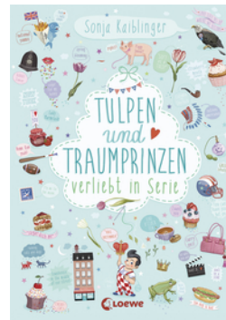
Love in Series | Episode 3 – Tulips and Prince Charmings (Vol. 3)