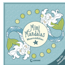
Mini Mandalas - Mermaids