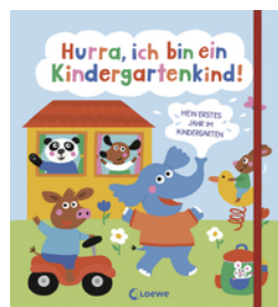
Hooray, Finally I am in Kindergarten