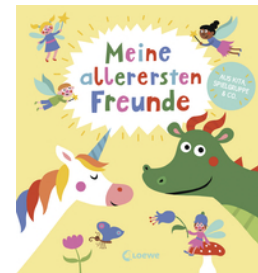
My Very First Friends - Mythical Creatures