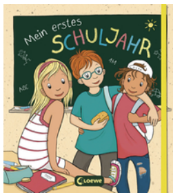
My First Year of School