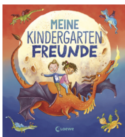
My Kindergarten Friends - Dragons