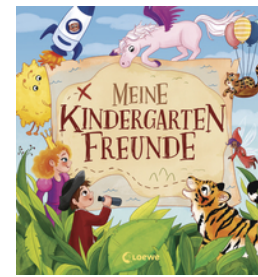
My Kindergarten Friends - Magical Creatures, Animals & Co.