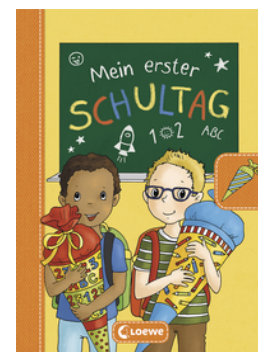
My First Day at School - Boys