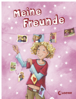
My Best Friends