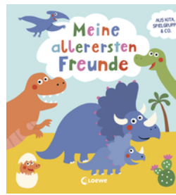
My Very First Friends - Dinos