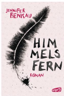
Far from Heaven