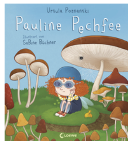
Pauline the Flop-Fairy