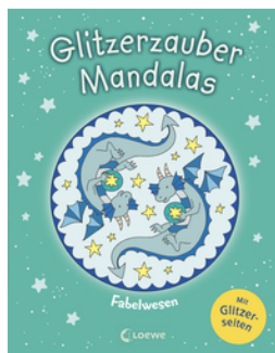
Enchanting Glitter Mandalas - Legendary Heroes