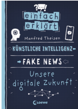
Simply explained - Artificial Intelligence - Fake News - Our Digital Future