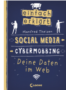
Simply Explained – Social Media, Cyber-Bullying, Your Data on the Web