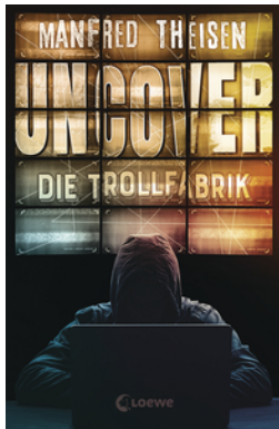
Uncover - The Troll Farm