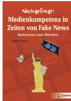
A Guide to Media Literacy in Times of Fake News