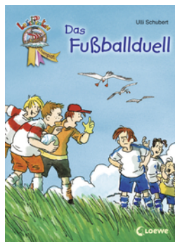
Reading Pirates Champion The Football Duel