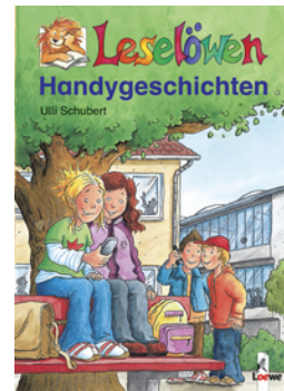
Mobile Phone Stories