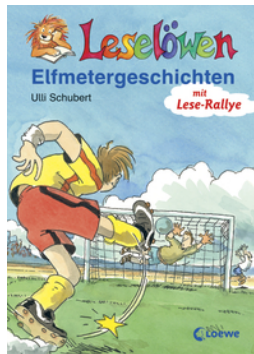
Reading Lions - Penalty Kick Stories