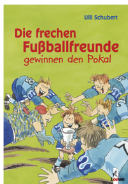
The Football Friends Win the Cup