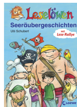
Reading Lions Pirate Stories