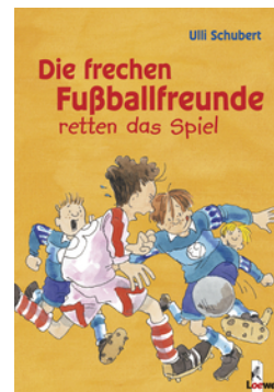
The Football Friends Save the Game