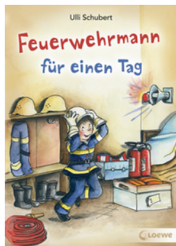
Being a Fire Fighter for One Day