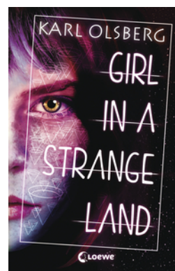
Girl in a Strange Land