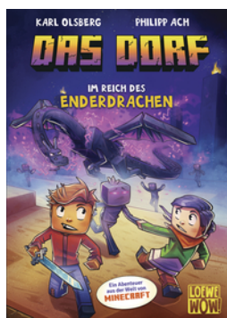
The Villagers - In the Empire of the Enderdragon (Vol. 4)