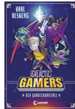
Galactic Gamers - The Quantum Cristal (Vol. 1)