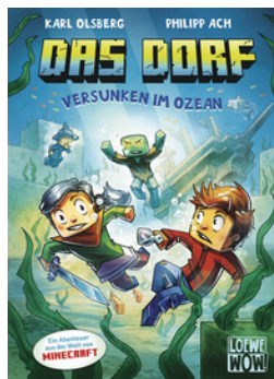
The Villagers - Sunk in the Ozean (Vol. 5)