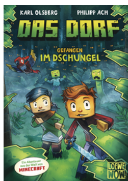
The Villagers - Trapped in the Jungle (Vol. 3)