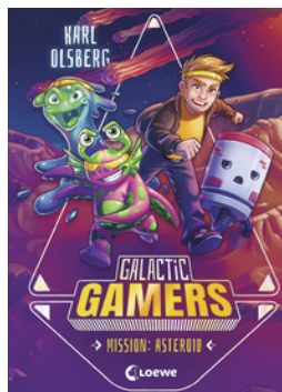
Galactic Gamers – Mission: Asteroid (Vol. 2)