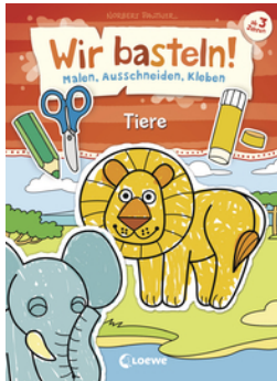
Let's Do Arts and Crafts! - Animals