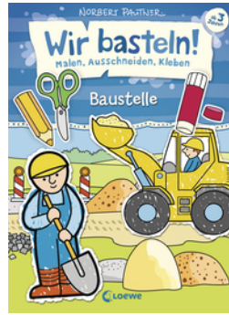
Let's Do Arts and Crafts! - Construction Site