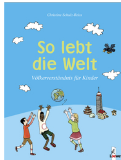
How The World Lives