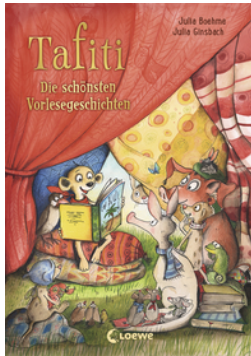
Tafiti – The Best Story Time Adventures for Reading Together