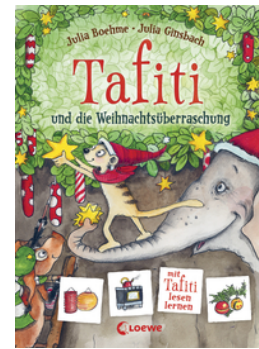
Tafiti - The Christmas Surprise