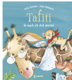
Tafiti – That's How You Get Well