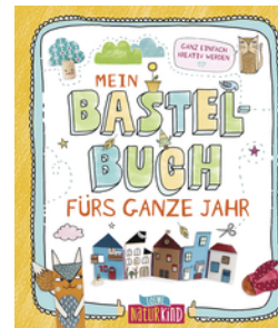
My Craft Book for the Whole Year