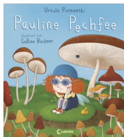
Pauline the Flop-Fairy