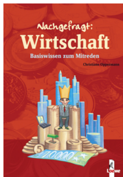
Guide to Economics