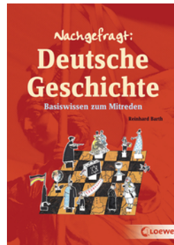
Guide to German History