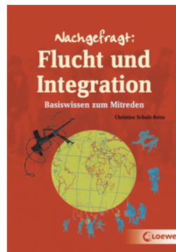
Guide to Refugee Migration and Integration