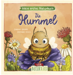
My First Naturebook – The Bumblebee