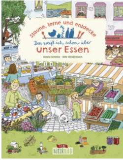
Wonder, Learn and Discover – All I Know About Our Food