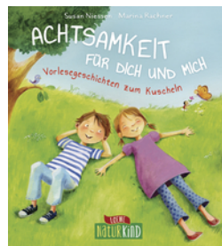
Attentiveness for All of Us! – Story Time is Cuddle Time!