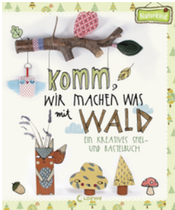
Let's Make Something with Wood