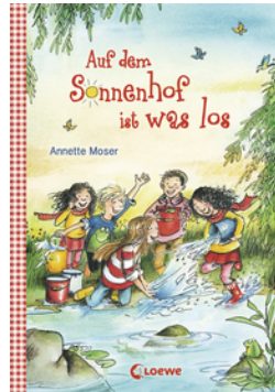
Sunny Farm – Something's up on Sunny Farm (Vol. 3)