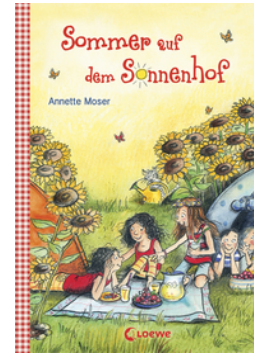
Sunny Farm – Summer on Sunny Farm (Vol. 2)