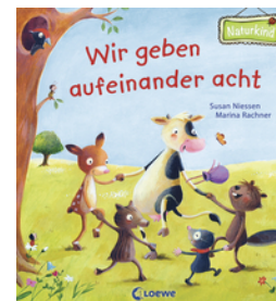
We care for each other!