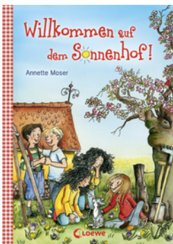
Sunny Farm – Welcome to Sunny Farm! (Vol. 1)