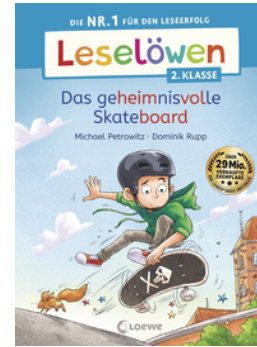
Reading Lions (Year 2) – The Mysterious Skateboard