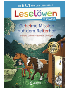
Reading Lions (Year 2) - Secret Mission at the Riding Stable