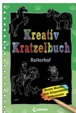
Creative Scratch Book - Riding School