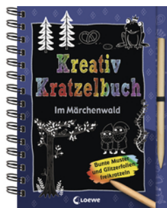
Creative Scratching - Tales' Forest