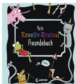
Creative Scratching Friendship Album