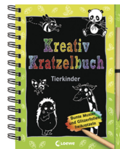
Creative Scratching - Animal Kids