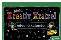
Creative Scratching: Advent Calendar