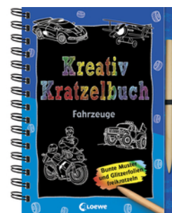
Creative Scratch Book - Vehicles