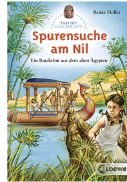
History Mysteries - Robbers on the Nile