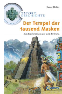
History Mysteries - The Temple of Thousand Masks