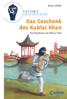
History Mysteries - Kublai Khan's Present