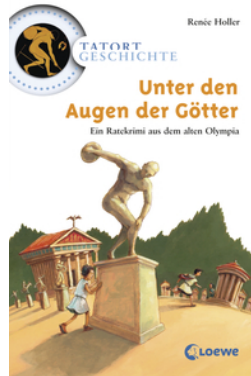
History Mysteries - Under the Eyes of the Gods