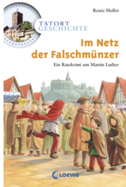
History Mysteries - Caught in the Forger's Web