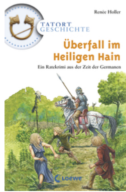
History Mysteries - Attack in the Sacred Grove