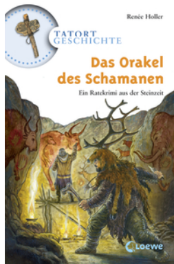
History Mysteries - The Shaman's Oracle