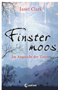
Finstermoos – At Death's Door (Vol. 3)