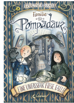
Meet the Pompadauz - An Incredibly Nasty Trap (Vol. 2)