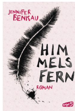
Far from Heaven