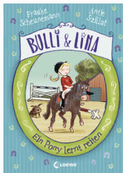
Bulli and Lina - A Pony Learns to Ride (Vol. 2)