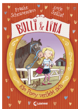
Bulli & Lina - A Pony in Love (Vol.1)