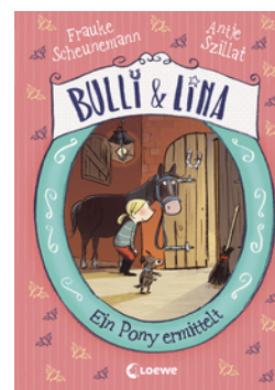
Bulli & Lina - A Pony Investigates (Vol. 4)