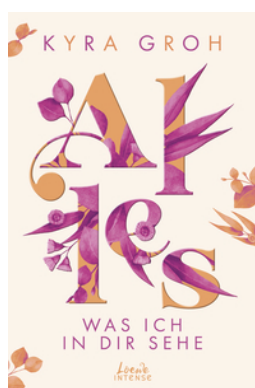
All That I See In You