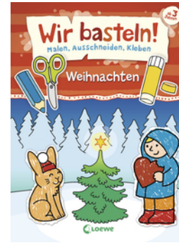
Let's Do Arts & Crafts! - Christmas