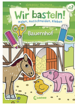
Let's Do Arts and Crafts! - Farm