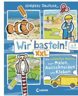
Let's Do Arts & Crafts! XXL - The most beautiful designs to paint, cut out and glue (blue)