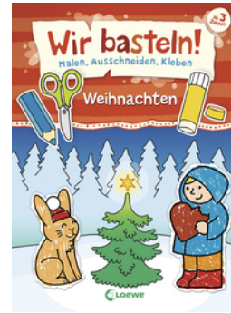
Let's Do Arts & Crafts! - Christmas