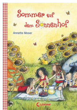
Sunny Farm – Summer on Sunny Farm (Vol. 2)