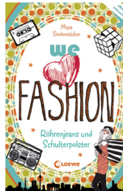
We Love Fashion - Drainpipe Jeans and Shoulder Pads (Vol. 1)