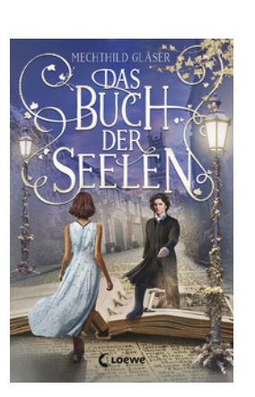
The Book of Souls