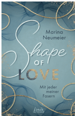
Shape of Love – With Every One of My Fibres