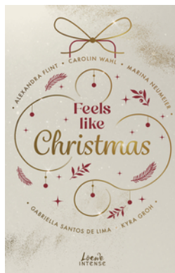
Feels Like Christmas