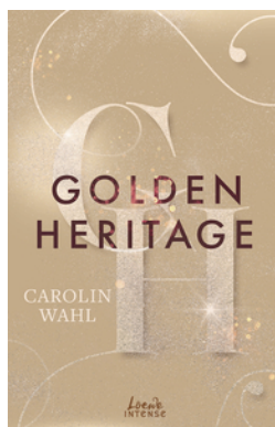
Crumbling Hearts (Vol. 2) – Golden Heritage