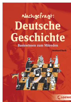
Guide to German History