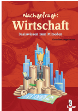
Guide to Economics