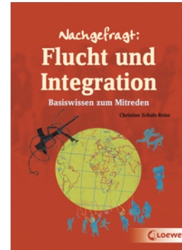
Guide to Refugee Migration and Integration