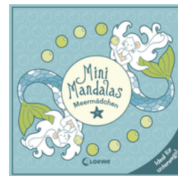
Mini Mandalas - Mermaids