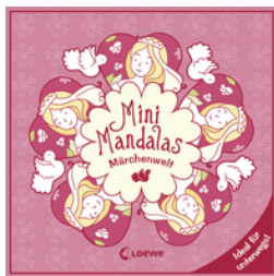
Mini Mandalas - Fairy Tale World