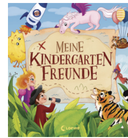
My Kindergarten Friends - Magical Creatures, Animals & Co.