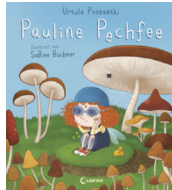
Pauline the Flop-Fairy