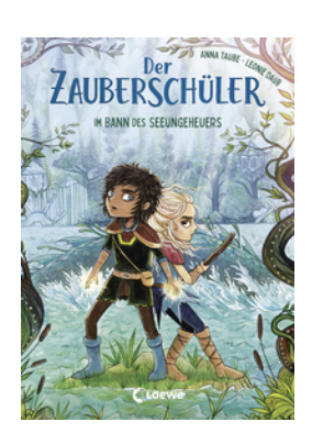
The Sorcerer's Apprentice – Under the Spell of the Sea Monster (Vol. 2)