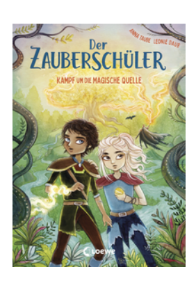
The Sorcerer's Apprentice -Battle for the Magic Spring (Vol. 4)