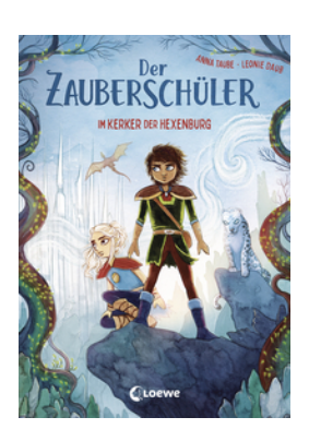
The Sorcerer's Apprentice - In the Witch Castle's Dungeon (Vol. 5)