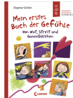
My First Book of Feelings