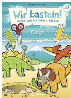
Let's Do Arts & Crafts! - Dinosaurs