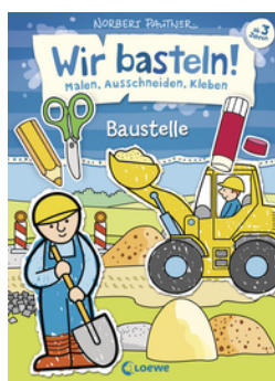
Let's Do Arts and Crafts! - Construction Site