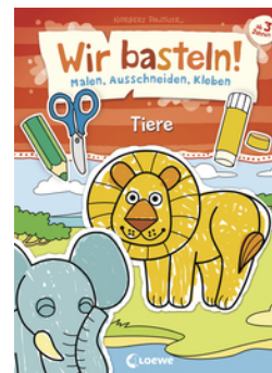
Let's Do Arts and Crafts! - Animals