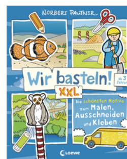
Let's Do Arts & Crafts! XXL - The most beautiful designs to paint, cut out and glue (blue)