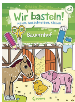
Let's Do Arts and Crafts! - Farm